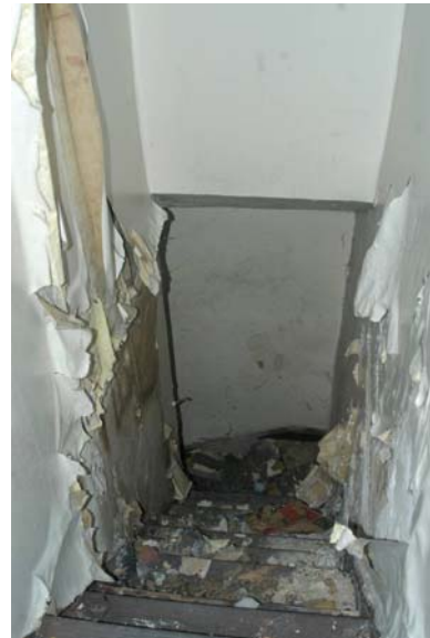
The grand staircase