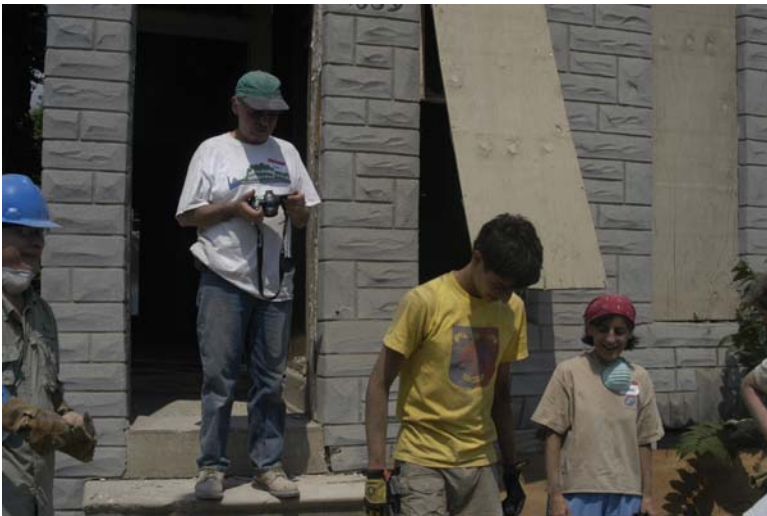
The crew, young and old.