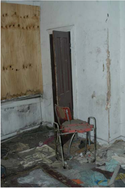
No wonder we filled a dumpster on day # 1!