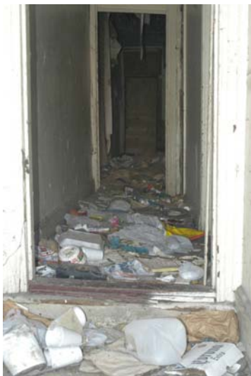
Here we go.....