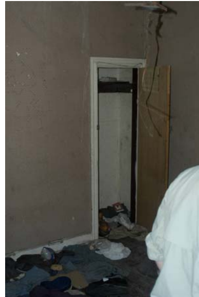
Clothes and a devotional left behind