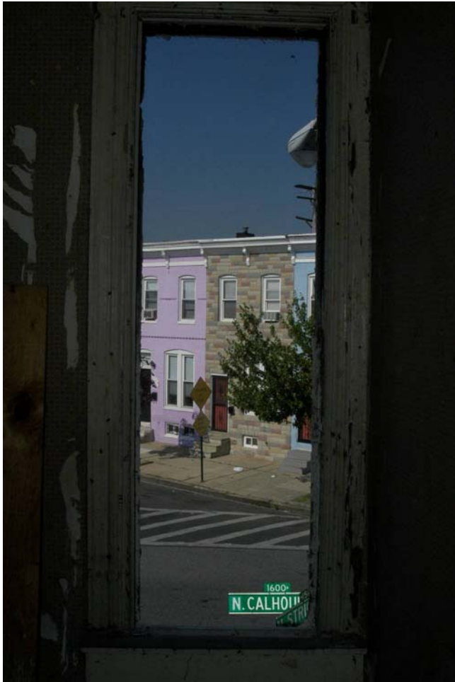
Glimpses of hope across the street