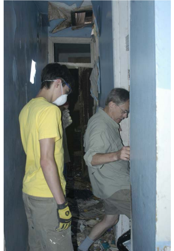
Our fearless leader